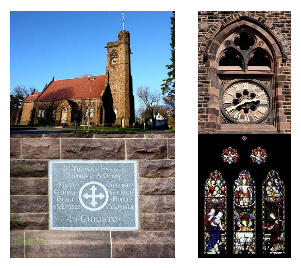
Church Website: http://www.saintthomasmmrk.org/

St. Thomas Episcopal Church (168 W. Boston Post Road) was built beginning in 1884 and completed in 1886. The Gothic Revival-style Church is constructed of Belleville brownstone with a red slate gable roof. It features a square tower on the north façade with clock faces and louvres. The St. Thomas Episcopal Church complex was added to the National Register of Historic Places in 2003.