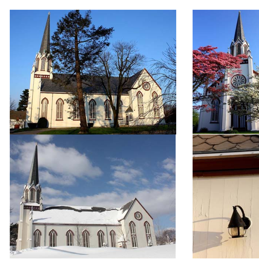
Church Website: http://www.mamaroneckumc.org/

The Mamaroneck United Methodist Church (546 E. Boston Post Road) was constructed in 1859. The Church's architect was Solomon Gedney. The Church was listed in the National Register of Historic Places in 1992 for its Gothic Revival architecture. It was constructed with a wood frame with a gable roof.