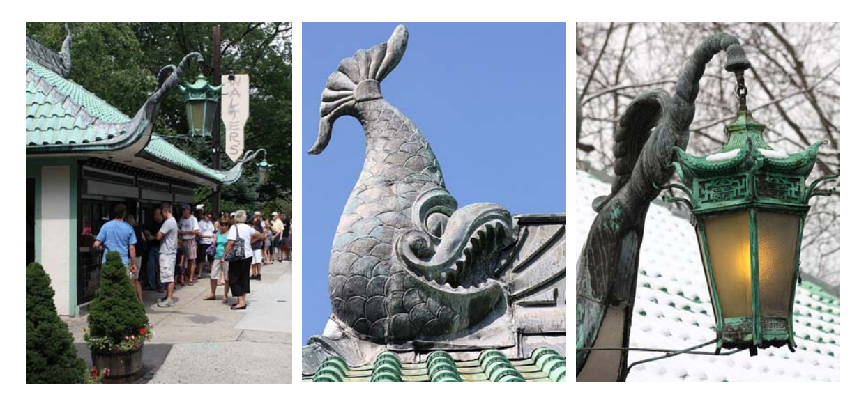
Walter's Website: http://www.waltershotdogs.com/index_flash.html

Walter's Hot Dog Stand (937 Palmer Avenue) was constructed in 1928. The restaurant was established by Walter Warrington in 1919. The building is typical of the attention-getting style of roadside restaurants in the 1920s. The restaurant has a pagoda-style roof, two Chinese lanterns, and two giant carp. Walter's was listed in the National Register of Historic places in 2010.